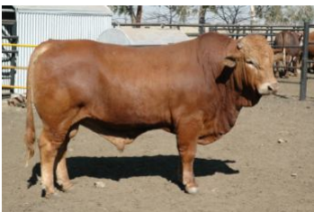
Excelsus Gas HDL0657 B

The first Zorro son sells! Zidaan was used in our program and now will be doing duty at ZM family Trust with Sakkie Coetzee.