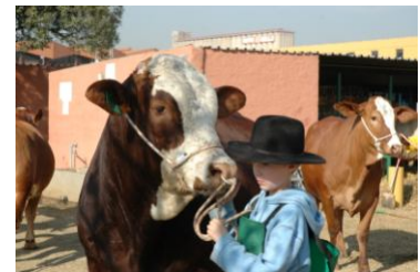
Ian and Lanzerac in Action