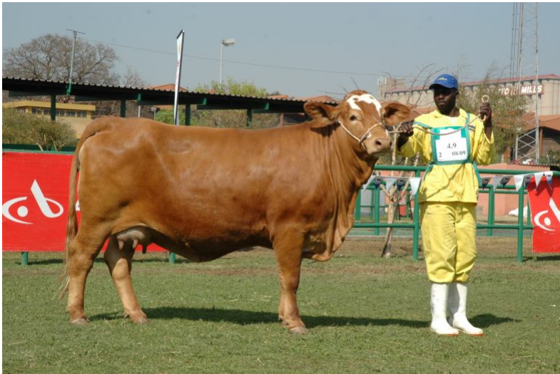
Pretoria Breed Champ Excelsus Santi HDL04104B