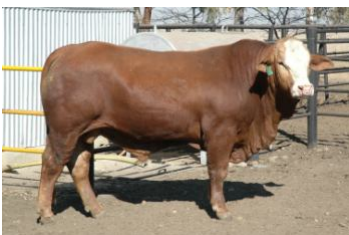
Zamugo Zidaan AZ0671B