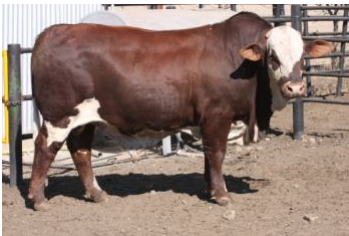
Excelsus Zin Zan. HDL0625B