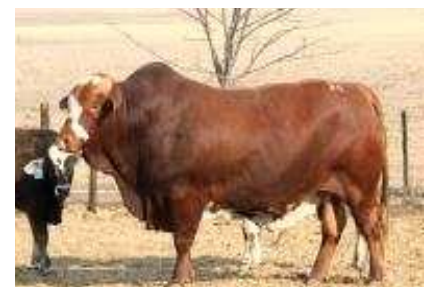
Excelsus Mcix HDL04112C