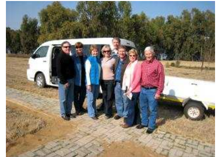
Texans in Africa!!!!!!