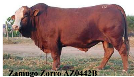
Zamugo Zorro AZ0442B