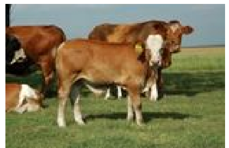
Platinum Calves at Excelsus