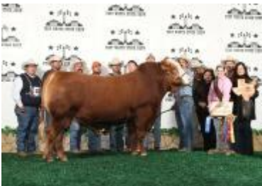
Red Bull Iet son LMC No Limit

Patriot boasts a dam line that ranks among the best in the business. Sired by the world famous Red Bullet and out of She Moves, the most popular Simbrah cow in the United States. Patriot has the backing of four of the La Muneca Dream Team super Donor Cows including the great 3E89 cow that bred Full House. Patriot has bred some awesome calves for Excelsus with El Amigo, El Shura, El Patriot, El Aztec, El Mexico all vying for Top Gun honours. Heifers such as La Penny, La Charity, La Qik,, La Kit and La Ribbon are shouting for a place on the Excelsus elite heifer group.