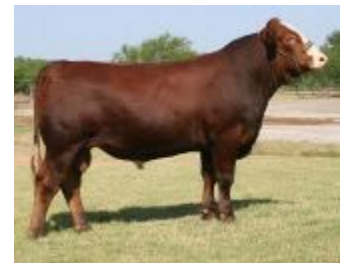
Red Bull Iet Son LMC Suave