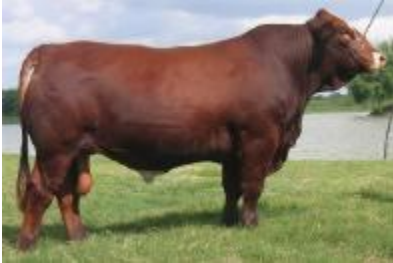
Red Bull Iet