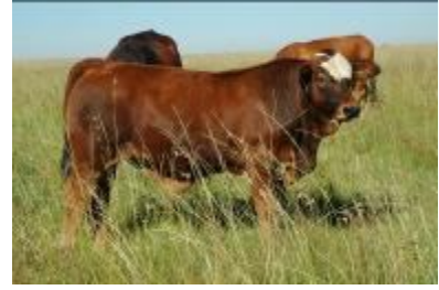
Excelsus El Amigo