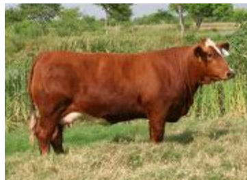
Red Bull Iet Full I Sister Morning Star