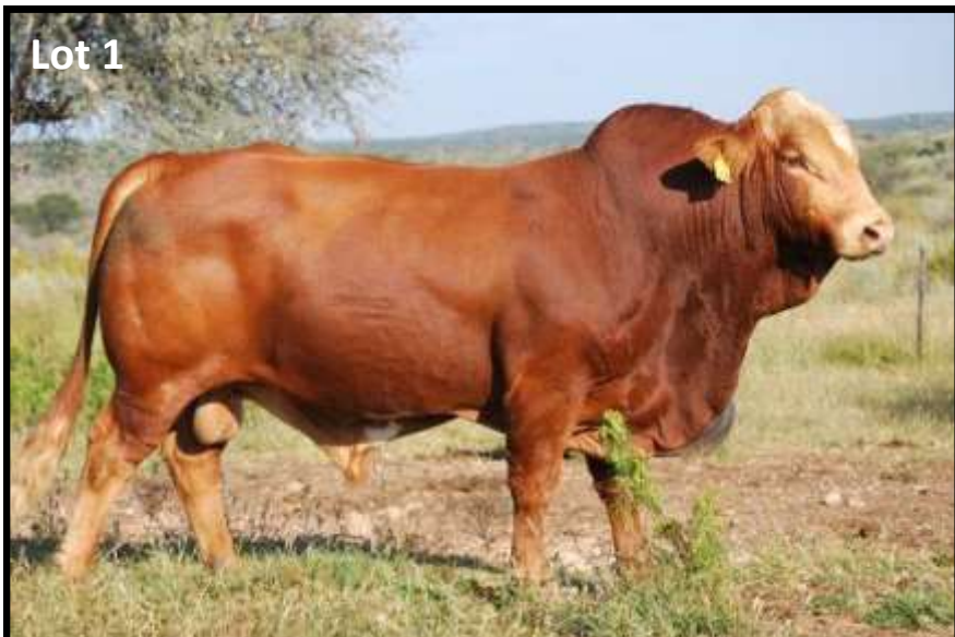
Lot 1 OH0998 (P)

n Uitstaande Diana's Dynamite poenskop seun. n Diep bevelsde, bree bul wat vir elke boer aanvaarbaar sal wees. Hierdie bul het regtig besondere bouwvorm, diepte, kapasiteit en vel en haar. Hy vertoon uitstekende sekondere manlike eienskappe. Die bul het n los geplooid vel wat n aanduiding van goeie groei is. OH 0998 is n "all rounder" wat n impak op die meeste vleisbeeskuddes sal kan maak.