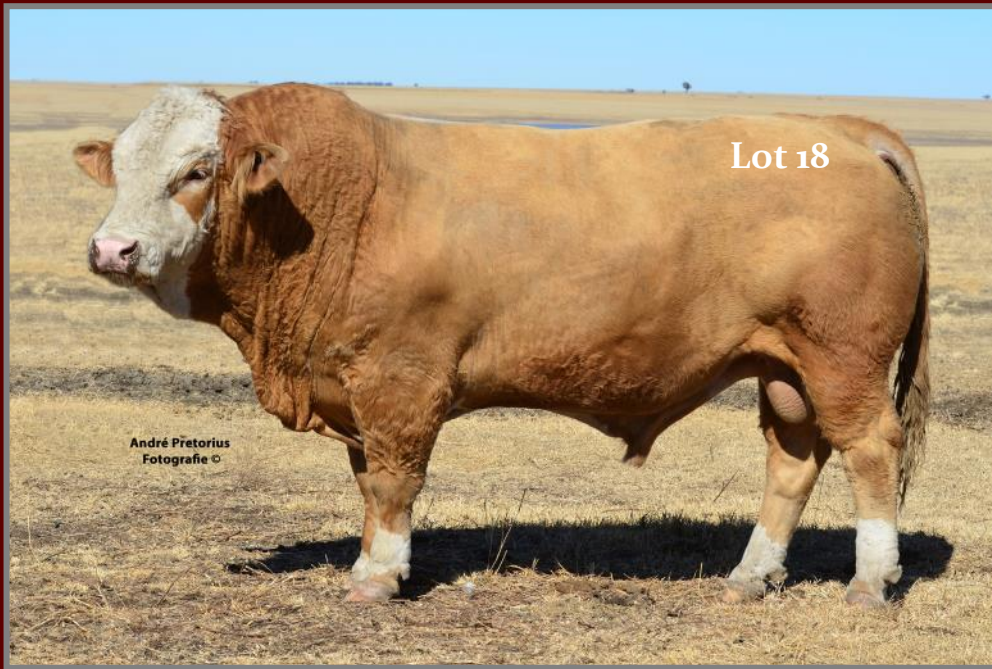
BM106 Mont-Beau Espresso (P)

BM +1 Kg 200 +17 400+27 600 +30 Milk +10