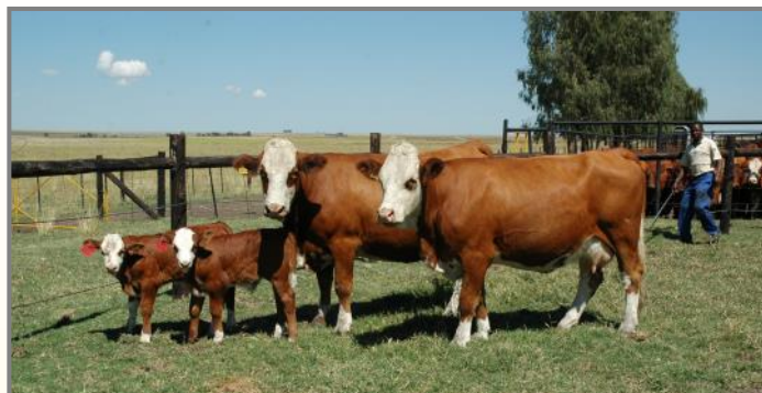
Noble Joe calves Noble Man and Noble Chance at foot with their dams DeVil Diedre and Anroda Bermien